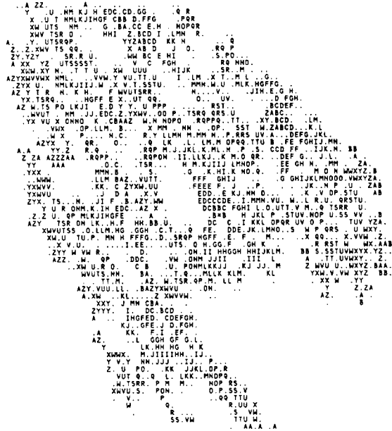
Figure 1. Example of a part of an infinite cluster grown at criticality. The asterisk '*' is an arbitrary point in the cluster. Sites belonging to shells of successive chemical distance are designated by successive letters of the alphabet (starting with 'B'), and dots designate sites which were tested and found to be empty. The cluster was generated on a triangular lattice, obtained by taking points to lie on a square lattice and regarding sites along one of the diagonal directions as nearest neighbours.

at least L shells (hereafter referred to as 'large' clusters). We assume that the ensemble averages \bar{B}(L) , \bar{S}(L) , and \bar{R}(L) all vary as algebraic powers of L . The chemical distance exponent \tilde{\nu} is defined as